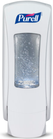
PURELL® ADX-12™ Dispenser