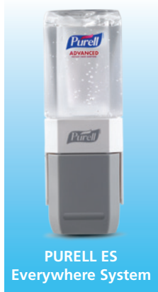
PURELL ES Everywhere System