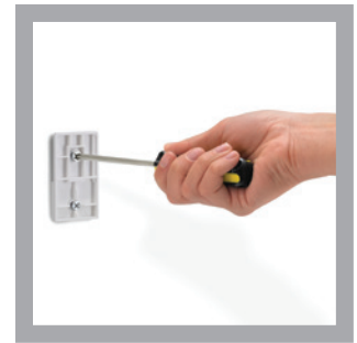
Screw wall mount