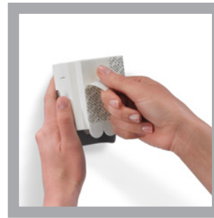
Adhesive wall mount

The PURELL ES™ Everywhere System offers four mounting options to provide the utmost versatility for every placement need.