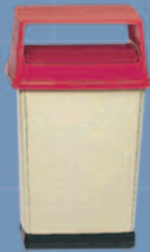
56 Gallon Cans