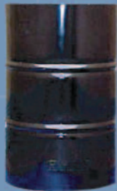
55 Gallon Cans