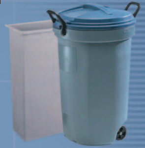
33 Gallon Cans